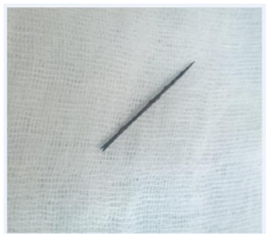
Figure 2: The rusty sewing needle found in the cavity of the right atrium embedded in its wall.

remove intra-cardiac needles once diagnosed to avoid potential hazards or prevent further damage [4]. These hazards include embolization, thrombus formation, endocarditis, pericarditis and injury to cardiac structures including cardiac perforation and pericardial tamponade. [5] Hazards are more prone when the needles are located in left-sided chambers and when partially embedded in myocardium [6].