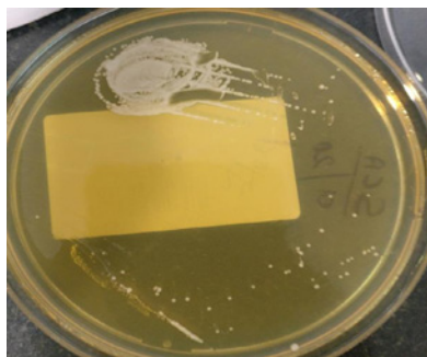
Figure 4: Growth of creamy white colonies of Cryptococcus on SCA media.