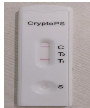
Figure 2: Cryptococcal Ag was detected in CSF by immunochromatography test (lateral flow assay).