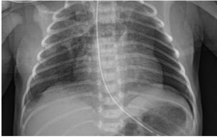
Figure 3: Plain radiograph of the chest, showing the Spinnaker-Sail Sign.

usually enough to diagnosis pneumomediastinum, it may show a halo around the heart border or air elevating the thymus and giving rise to a crescentic configuration and a wind blown spinnaker sail as in our patient [7,8].