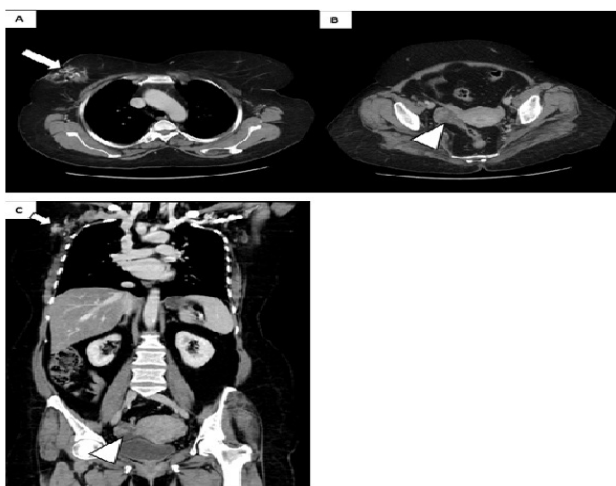
Figure 4: Selected axial cuts at the level of the aortic arch (A) and at pelvic region (B) as well as coronal reformate reveals right breast mass with calcification (arrow) and right ovarian heterogeneous mass (arrowhead).

skin, skeletal muscles, and other connective tissues [2]. In juvenile dermatomyositis, soft tissue calcifications termed “calcinosis” are common in approximately 10%-40%, however it is uncommon in cases of adult onset dermatomyositis [3]. Risk factors attributed to the development of calcinosis include young age and delayed diagnosis or therapy [4].