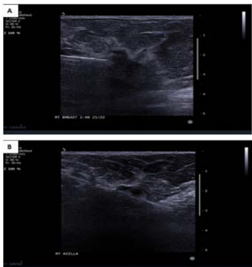
Figure 3: Ultrasound guided biopsy from the mass (A) and from the right axillary lymphnodes (B).