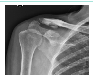
Figure 1: Radiographic showing accessory joint between the coracoid and the conoid tubercle.

A case of painful right shoulder in a 39 year old Thai female. She had a painful range of motion due to forward flexion and adduction with no any limit active range of motion for 5 months. The diagnosis was confirmed with incisional biopsy for tissue pathological report. 9-months after treated with arthroscopic coracoclavicular joint resection, she regained a pain-free range of motion.