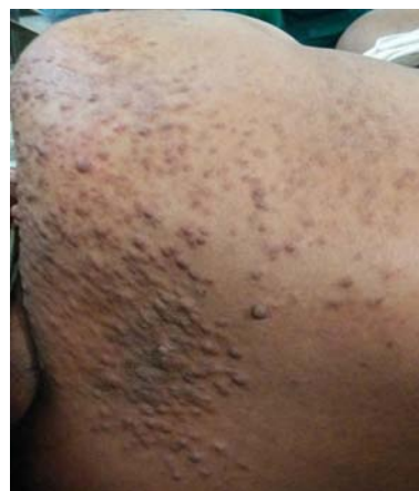
Figure 1: Multiple nodules and papules over right scapular region.

In 1854, Virchow first described cutaneous leiomyomas as a rare condition characterized by the presence of tumours, inherited in the autosomal dominant pattern. The gene defect was reported to be affecting Fumarate hydratase – one of the enzymes of the Krebs cycle. The mutation of the fumarate hydratase gene was found to result in