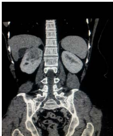
Figure 2: CT Urogram image of the right renal mass.