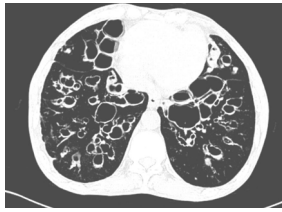
Figure 1: High resolution computed tomography of thorax showing bilateral lower lobe predominant cystic bronchiectasis along with tree in bud nodules.