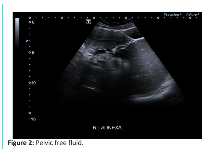
Figure 2: Pelvic free fluid.

The patient was treated as a likely ruptured ectopic pregnancy. A haemorrhagic corpus luteum was also considered. With consent, an emergency laparoscopy was arranged using a direct umbilical port entry. Paradoxically, there was no evidence of haemorrhage. The pelvis was dry, and the uterus and tubes were normal however, a large, right-sided ovarian cyst was identified, filling the Pouch of Douglas and extending across the midline up along the posterior abdominal wall (Figure 3). The cyst was smooth-walled, intact and showed no evidence of torsion. No further action was taken. A Dilation and Curettage (D&C) were performed, having noted the falling hCG titres. Currettings were sent for histopathology.