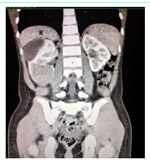
Figure 1: CT scan showing the right renal tumour (R=Right).

tumor extended into the renal pelvis and capsule but did not appear to breach the capsule. Microscopically, the tumor was composed of sheets and nests and perivascular cuffing of large polygonal epithelioid cells. These cells had mildly pleomorphic, vesicular nuclei with prominent nucleoli and abundant granular to clear cytoplasm. The cells were densely pigmented by melanin. Mitotic figure were rarely seen. The tumor was seen invading but not breaching the renal capsule. The ureter was free from tumor. The adjacent renal parenchyma was compressed by the tumor bulk. No lymphovascular invasion was seen. Immunohistochemically, the tumor cells were positive for HMB45 and Melan A but negative for CD10. These descriptions were diagnostic for PEComa, non-malignant. The patient came for regular follow up and serial ultrasound imaging; at one year follow up the patient remained well and radiologically there was no recurrence of tumor.