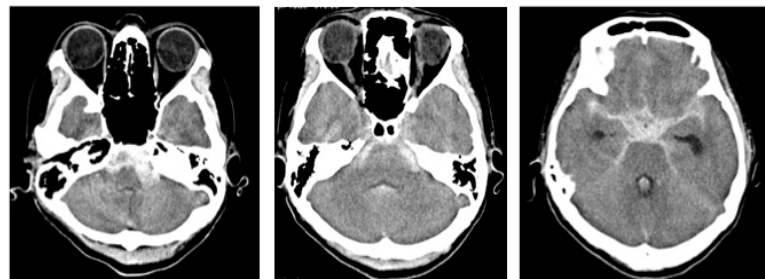
Figure 2: Emergency computed tomography (CT) scan showed diffuse SAH with left sided thickness.

was dislodged from the aneurysmal lumen due to wide aneurysmal neck. So, the tip of SL-10 microcatheter was re-introduced into the aneurysmal lumen through a cell of the stent (trans-cell technique). Finally, CERECYTE Delta Plush coils (4 mm x 6 cm, 3 mm x 4cm, 2 mm x 3 cm, Codman & Shurtleff, Raynham, MA, USA) were inserted into the lumen through the microcatheter (Figure 3C). Although slight body filling was seen after the placement of three coils, we assumed to leave a slight filling into the aneurysmal dome because of the introduction of another coil.