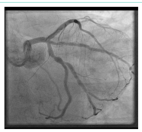
Figure 2: TIMI – III flow after primary angioplasty.

risk factor for VVLST [5]. Recent ACCF/AHA/SCAI PCI guidelines recommended the indefinite continuation of aspirin in patient with PCI and DES [6].