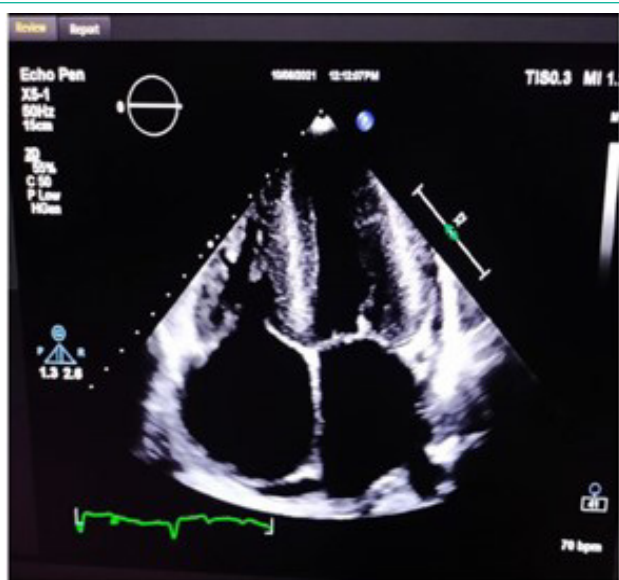
Figure 1: Echocardiogram of patient with cardiac amyloidosis showing biatrial enlargement.