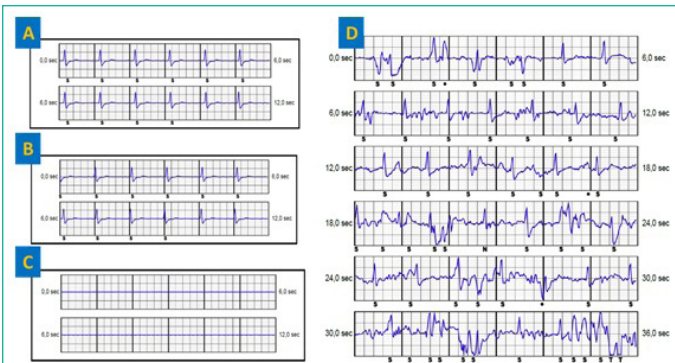
Figure 1: (A) Primary vector. (B) Secondary vector, similar to the primary vector. (C) Flat alternate vector (D) event classified as VT showing mechanical artifacts.