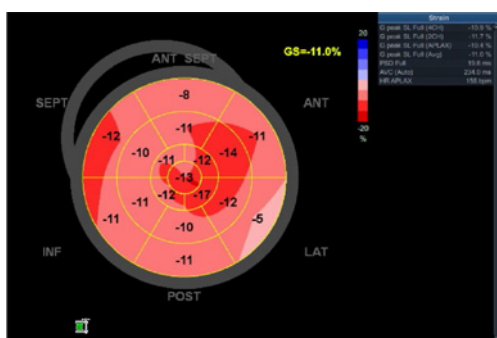
Figure 3: Left ventricular systolic function.