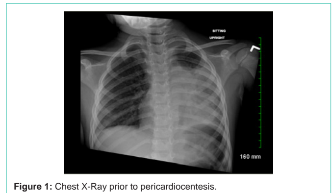
Figure 1: Chest X-Ray prior to pericardiocentesis.

She was intubated and placed on a mechanical ventilator, received fluid resuscitation and inotropic support. In addition to lung findings, a chest X ray was concerning for enlargement of the cardiac silhouette (Figure 1) and therefore an echocardiogram was requested which showed a large pericardial effusion (Figure 2) with clinical tamponade and (Figure 3) moderately to severe decreased left ventricular systolic function with a large circumferential effusion, largest pocket measuring ~22mm. There was partial right atrial collapse. Pericardiocentesis was performed emergently and 160ml approximately of yellow serous fluid were drained (Figure 4). Hemodynamic condition and LV function by echocardiography