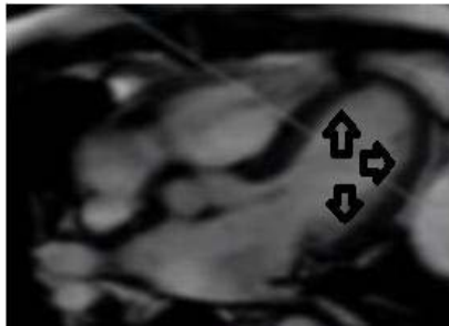
Figure 2: No LGE on cardiac MRI.

threatening side effects occurred as well, particularly opportunistic infection, tumor development, and cardiotoxicity.