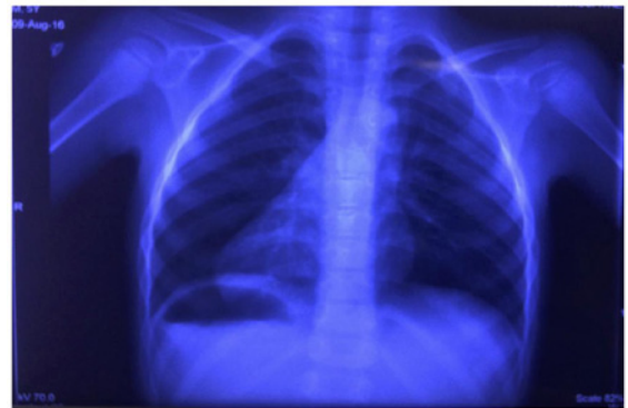
Figure 1: Chest X Ray showing abdominal situs inversus with dextrocardia.

Chest X-ray (Figure 1) and ultrasound of abdomen showed situs inversus totalis. Echocardiography revealed an unrestrictive Ventricular Septal Defect (VSD) and aortic override of 70%, severe pulmonary stenosis with peak gradient of 80mmHg and severe pulmonary regurgitation (Figure 2A), dilatation of the main and branch PAs, dilated and hypertrophied Right Ventricle (RV) and aorto-mitral discontinuity due to a large subaortic conus measuring 9mm (Figure 2B). Cardiac angiography (Figure 2C) was done, as an institutional criteria, to confirm the echocardiographic finding of anomalous origin of Right Coronary Artery (RCA) from Left Coronary Artery (LCA). It also showed a retroaortic innominate vein. Branch pulmonary arteries Z-scores were + 5.3 and + 4.6 for right (18mm) and left (17mm) respectively.