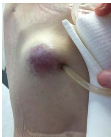
Figure 1: Violacious non-tender nodule at Pleurx exit site.

A 69-year-old female, who was one month post definitive chemoradiation for a Stage IIIB Squamous cell carcinoma of the lung, reported a new nodule at her Pleurx catheter exit site (Figure 1). This lesion was confirmed on fine needle aspiration to be metastatic squamous cell lung cancer consistent with the primary diagnosis.