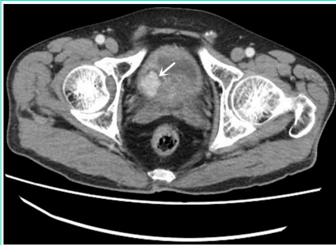
Figure 1: Intensified CT image of the abdomen (White arrow, the bladder occupancy shows significant enhancement after enhancement).