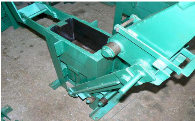
Figure 5: Electrical presses machine.