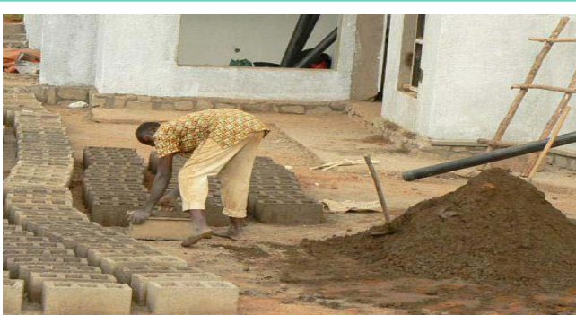
Figure 6: Priced out; the challenges for young professionals.

operated and others are powered with electricity or petroleum (Figures 4 & 5). Manual presses are operated by semi-skilled workers, whereas powered machines need more skilled operators and are more expensive to run.