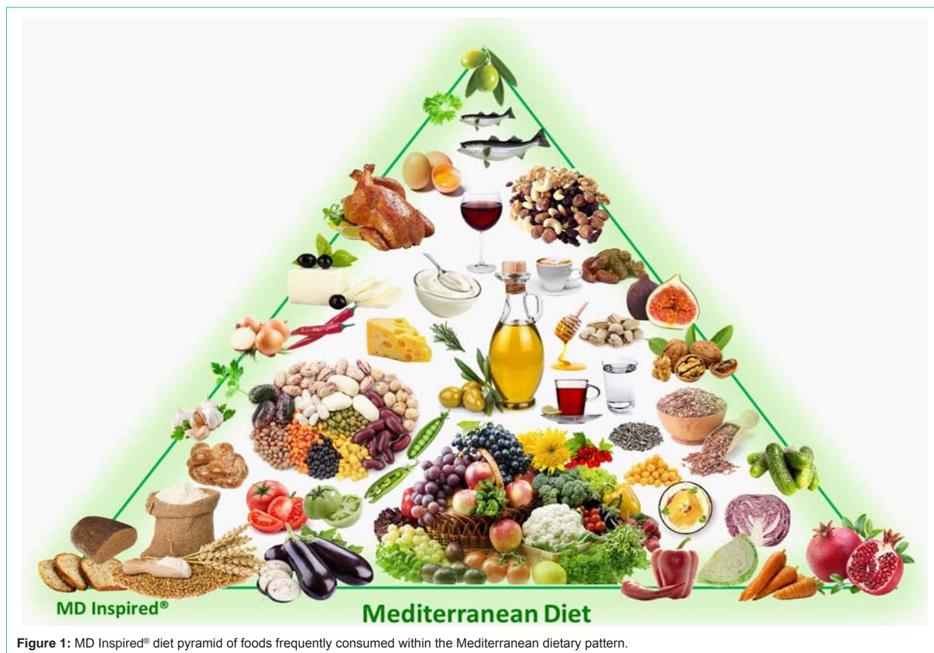
Figure 1: MD Inspired® diet pyramid of foods frequently consumed within the Mediterranean dietary pattern.

in this diet. Low-fat milk and fermented milk products, such as sour milk, yogurt, cheese, curds, then fish and seafood, and poultry and eggs are moderately consumed during the day or several times per week. Desserts containing refined sugars are consumed very rarely or occasionally for special occasions, such as holidays and family celebrations. The main difference in the traditional Mediterranean cuisine is that the traditional Mediterranean desserts are usually prepared with natural ingredients, such as dried fruits, nuts, spices and honey. Red meat and processed red meat products are also minimally consumed within the traditional Mediterranean dietary pattern [2,7-15].