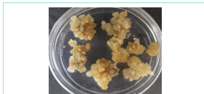
Figure 1: Callus formation in MS media containing 0.5 mg/l 2,4-D and 0.5 mg/l BAP.

Amaranthus seeds were surface sterilized and inoculated on MS medium. Inoculated seeds were germinated after 7 days. The in vitro grown leaves of A. tristis were used as explants for callus formation. MS medium supplemented with different hormones in different combinations were tested for effective callus initiation. The initiation of callus was observed on the cut ends of the leaves after 10 days of the culture. Callus induction frequency was highly varied between hormonal combinations tested. Of the different hormone concentration tested, MS medium supplemented with 2, 4-D and