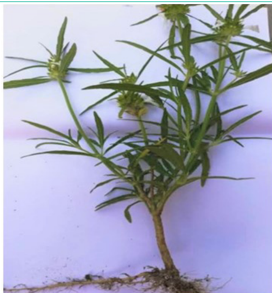
Figure 1: L. aspera plant.

The L. aspera Linn. methanol extract was chosen for a thorough investigation into the isolation, purification, and characterization of the active chemical responsible for neutralizing the cobra venom. This compound was found to have strong antivenom activity.