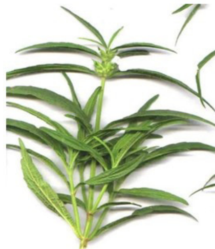
Figure 2: L. aspera stem.