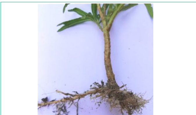
Figure 5: L. aspera root.