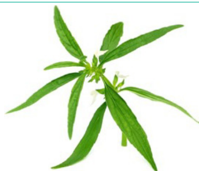
Figure 3: L. aspera leaves.