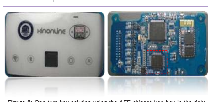
Figure 2: One turn-key solution using the AFE chipset (red box in the right figure), this configuration is for a Holter device and the experimental results suggested the approval of industry standard, regulated by the CFDA (China Food and Drug Administration, equivalent to the FDA in USA).