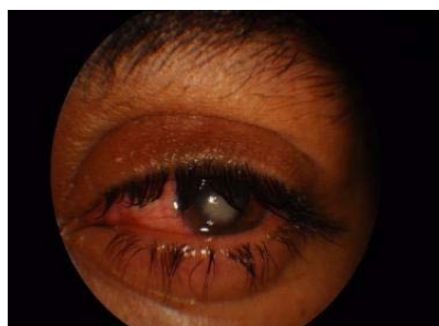
Figure 1: The patient's eye in the acute phase.

The patient hospitalized based on the initial diagnosis; keratitis. The obtained corneal material from smear was analysed via direct microscopic examination and fungal hyphae were seen. Following this, the patient's new therapy determined as hourly voriconazole ophthalmic solution, eight times a day moxifloxacin ophthalmic solution, five times a day synthetic tears, twice a day cyclopentolate (Figure 2). The patient was consulted to Infectious Diseases Department after the growth of Fusarium spp. in culture. Due to minimal improvement to the existing therapy, voriconazole optimised to twice a day 6 mg/kg intravenous therapy as a loading dose and twice a day 4 mg/kg intravenous therapy as a maintenance dose.