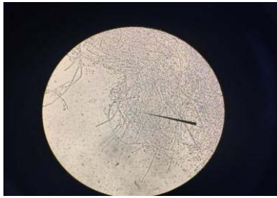
Figure 2: Microscopic view of corneal scraping material.