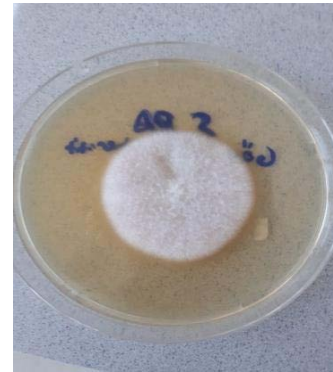
Figure 4: Fusarium colony on mycobiotic agar.

Microbial keratitis which is a corneal pathology, is one of the most frequent causes of vision loss, especially in developing countries. The etiology of keratitis varies by the climatic conditions and development levels of the countries. In tropical regions, the fungal agents are prevalent since the bacterial agents are the predominant microbial reason in the temperate zone. In Lalitha's and his colleagues' study, they researched the keratitis cases that are encountered in a large Ophthalmology Department in the south region of India for 11 years and in 8.206 out of 14.738 collected specimens, fungal growth was observed (34,4%) while in 5.912 specimens showed bacterial growth (24,7%). Fusarium species are the most frequent species that are isolated from the fungal agents (14,5%) [9].