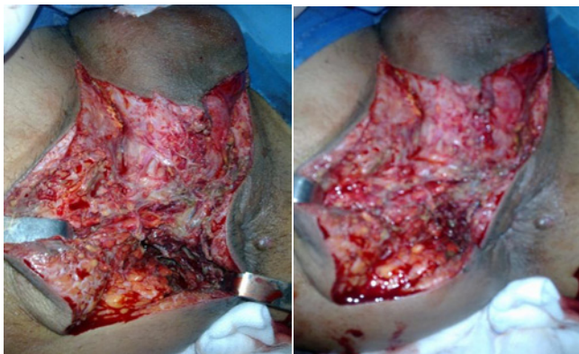
Figure 1: Fournier's gangrene complicating perineal abscess in a diabetic patient (Obs.3).