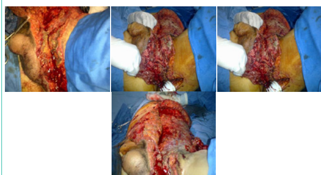
Figure 5C: Operative view after extensive and aggressive surgical debridement of all died skin and subcutaneous tissue involved.