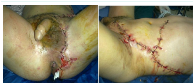
Figure 5D: The local evolution after surgical debridement and iterative revision of the bedside (14 times) leading to secondary reconstruction.