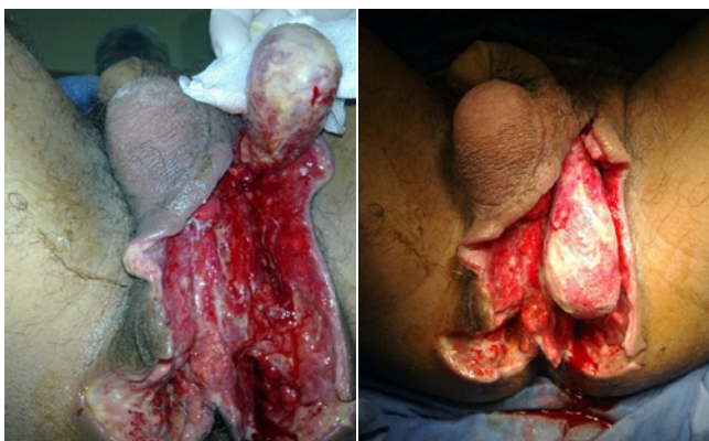
Figure 3A: Fournier's gangrene in a man after hemorroidectomy. View after first surgical debridement (Obs.4).