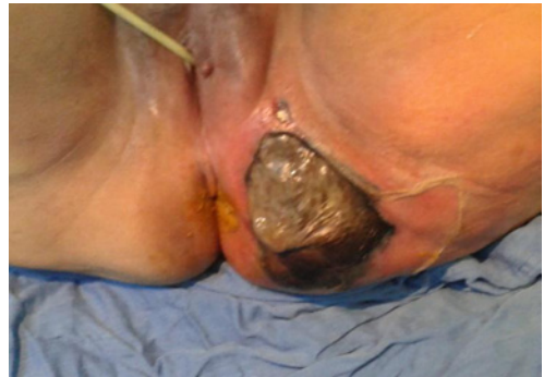
Figure 4: Fournier's gangrene complicating Bartholin's abscess (Obs.5).