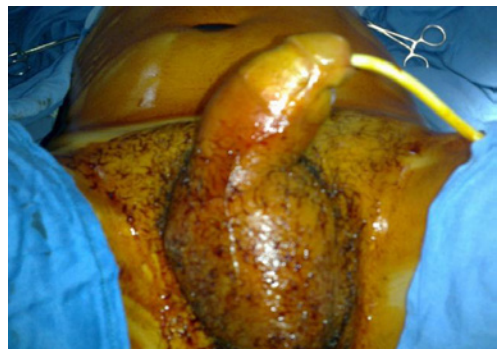
Figure 5A: Operative view: edema and swelling of the scrotum and the anorectal region (Obs.1).

and two were obese. The most common etiologic factor for FG was perineal abscess (six cases). Figure 1 and Figure 2 describe the local examination of two patients of them (Obs. 2 and 3). In one case, FG had complicated the post operative course of hemorrhoidectomy (Obs.4 and Figure 3A) and in one case (Obs. 5), the etiology was a Bartholin's abscess (Figure 4). The mean time to diagnosis was 4.3 days (range: 1-8 days).