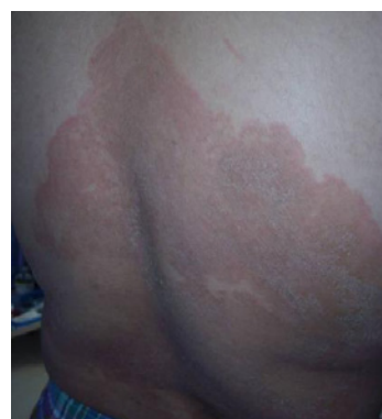
Figure 1: Abdomen cutaneous lesions.