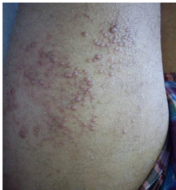
Figure 2: papulo-nodules.