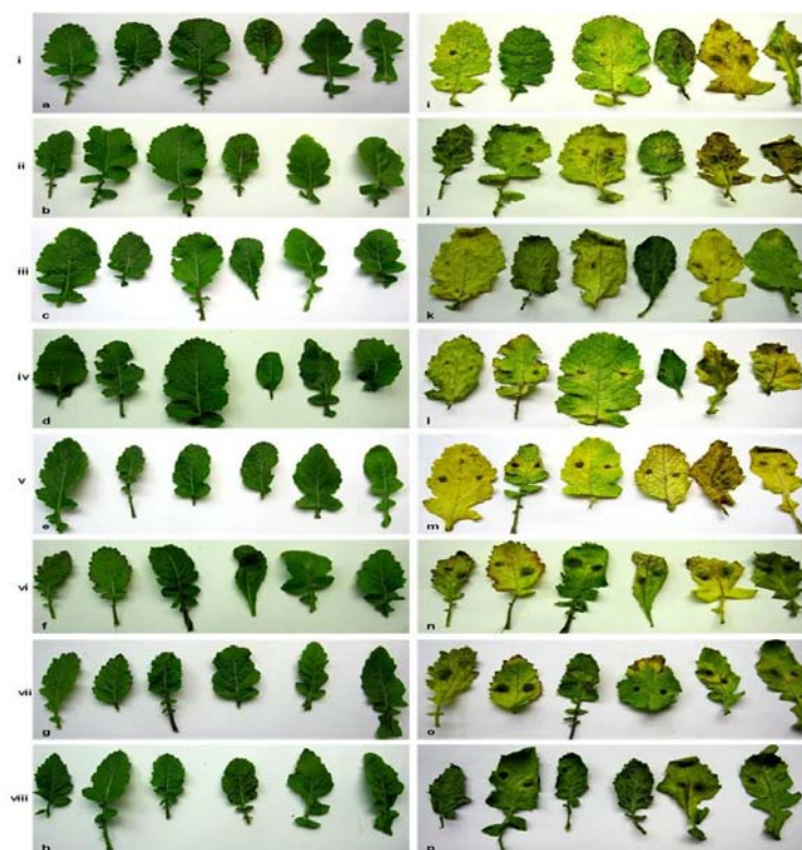
Figure 1: Pathological variation in A. brassicae isolates – (i-viii) ABc-P05, ABc-P06, ABc-P07, ABc-P08, ABc-P09, ABc-P10, ABc-P11 and ABc-P12 respectively, on different host differentials. From left to right - B. juncea var. Varuna, Rohini, Kranti and PHR-01; B. rapa var. YSH401 and Pusa gold. Left (a-h) and right side (i-p) show the healthy and inoculated leaves, respectively.

Assay for evaluation of systemic resistance induced by attenuated virulence was carried out using detached leaf method. A separate assay was carried out for each isolate showing non-aggressive behavior on a specific Brassica variety. The detached leaves from base of 30-day old plant of the respective Brassica variety were inoculated with 10 \mu l of four different suspensions: sterile distil water as control (C); spore suspensions of non-aggressive isolate; highly aggressive isolate; non-aggressive isolate (on 1 st day of inoculation) followed by spore suspension of highly aggressive isolate (on 3 rd day of inoculation). The inoculated leaves were incubated for 10 days at 22 \pm 2^\circ\text{C} and 12 hr light/ 12 hr dark photoperiod in moist chambers. Host response to pathogen’s aggressiveness and disease score was assessed as earlier and data was analyzed statistically for induction of systemic resistance.