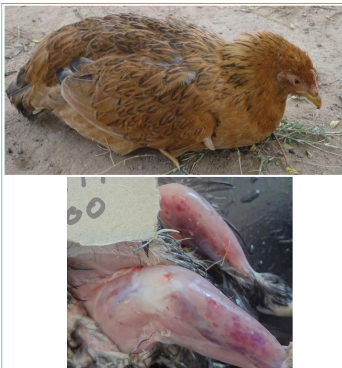
Figure 1: Ruffled feathers in a depressed and Haemorrhages on thigh and leg muscles of an indigenous chicken pullet suffering from infectious bursal disease [54].

The clinical signs of IBD vary considerably from one farm, region, country or even continent to another [79]. In acute form, birds are prostrated, debilitated, dehydrated, with water diarrhea and swollen vents stained with faeces. In birds below three weeks, the disease is asymptomatic, but birds have bursal atrophy with fibrotic or cystic follicles and lymphocytopenia before six weeks and are usually susceptible to other infections that would be contained in immunocompetent birds (Figure 1) [54].