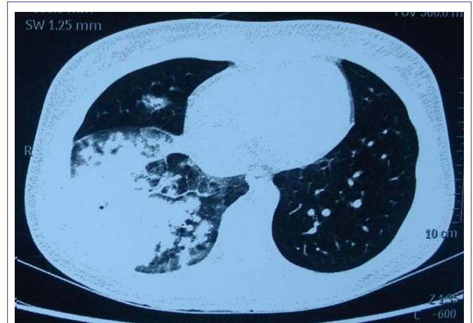
Figure 1: Chest CT scan showed large consolidation in the right lower lobe and patchy consolidation in the middle lobe.