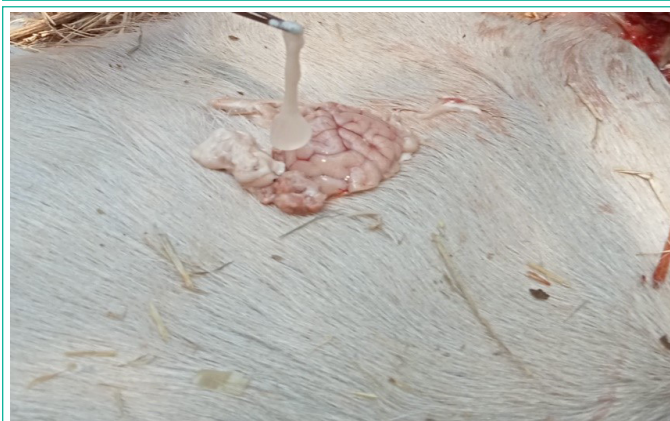
Figure 2B: A cyst after protruded from the brain.