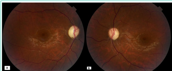
Figure 4: Retinography of the right eye (A) and left eye (B) 6 months after the onset of symptoms showing total papillary pallor.

Leber's optic neuropathy was suspected, and a genetic study was conducted to investigate a possible mitochondrial mutation that could confirm the inheritance of the disease. A favorable result NC_012920.1:m.11778G>A was obtained six months later in the patient and his mother's ND4 mitochondrial gene, which confirmed the diagnosis of Leber's optic neuropathy.