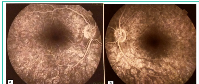
Figure 2: Fluorescein angiography of the right (a) and left (b) eye: no retention or leakage abnormalities in the late phase.