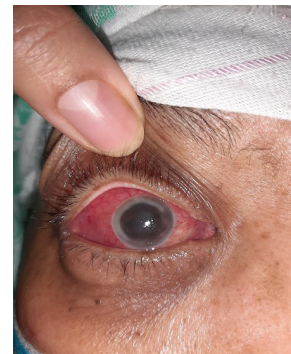
Figure 1: Right eyelid swelling, sub conjunctival abscess, corneal injection, and anterior chamber hypopyon.

antibiotics eye drops, the evolution is marked by spontaneous drainage of sub conjunctival abscess (Figure 4) and regression of pain. She was later transferred to Oncology department for the treatment and follow up of her cancer.