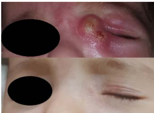
Figure 1: The clinical photograph of the face at the time of presentation showing unilateral acute dacryocystitis with lacrimal abscess formation. Note the regression of the collection after traitement.

Acute dacryocystitis in neonates is an emergency condition that should be taken seriously [1]. We report a case of a 25-day-old male newborn with inflammatory swelling of the inner canthus of the left eye. The ophthalmological examination revealed unilateral lacrimal sac abscess with compression of the lacrymal sac (Figure 1). Orbital CT scan confirmed the presence of abscess, with mild preseptal cellulitis (Figure 2), no signes of ethmoidal sinusitis were shown. The newborn