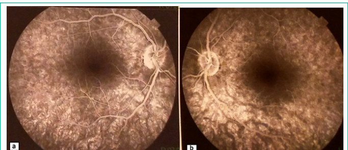
Figure 2: Fluorescein angiography of the right (a) and left (b) eye: no retention or leakage abnormalities in the late phase.