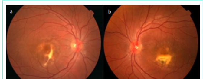
Figure 1: Right and left fundus showing yellow macular lesion.

Ophthalmologic examination showed corrected visual acuity 5/10 in the right and 3/10 in the left eye; P4 near in both eyes. The examination of the anterior segment was normal. Intraocular pressure of both eyes was within the standards. In addition, fundus examination in the right eye showed a yellow macular lesion, with a large vertical axis, measuring about 2 papillary diameters with a fibrotic aspect [2]. However, in the left eye, we observed a similar lesion, oval, but with horizontal long axis, measuring about 3/2 papillary diameters with a grayish and irregular aspect in the center (Figure 1). The fluorescein angiography test showed in the right eye a hyperfluorescence surrounding an area of hypofluorescence confirming the appearance of fibrosis seen on fundus of the eye. In the left eye, the hyperfluorescence is limited to the lesion and irregular in the center (Figure 2). The patient was diagnosed Best Vitelliform macula.