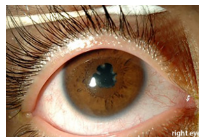
Figure 1: Posterior synechiae (OD).

In February 2016, the patient had trabeculectomy with Mitomycin C in his right eye in superior nasal quadrant, but the surgery failed after one month. Subsequently, repeated trabeculectomy with Ex-PRESS mini shunt under sclera flap had been done. One month later,