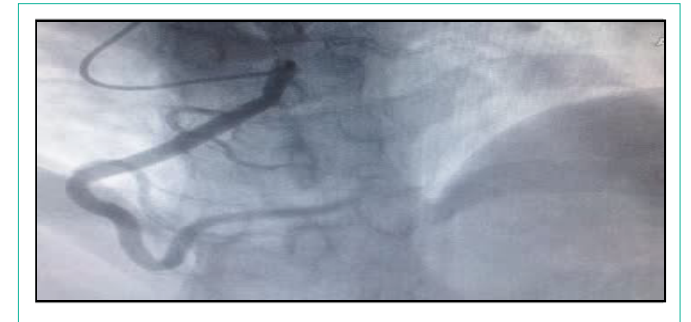
Video 1: Coronary angiography revealed anomalous right coronary artery from the left sinus of valsalva.