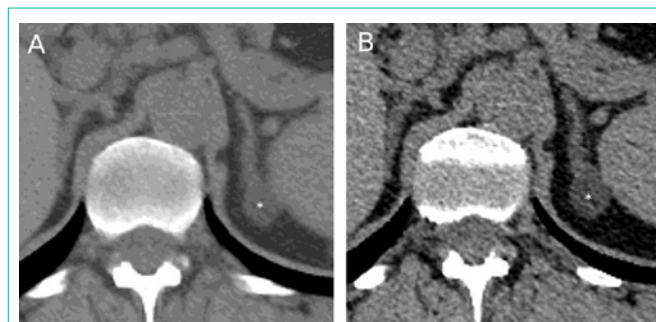
Figure 2: Hematoxylin-eosin stained left adrenal cortical adenoma at 25X (A) and 250X (B) Magnification.

During the first assessment of our patient, accordingly with guidelines pheochromocytoma was excluded by 24h urinary catecholamines levels and a metoclopramide test, cortisol overproduction by 1 mg overnight dexamethasone suppression test and aldosterone overproduction by the finding of normal potassium levels and a normal ARR. The natural history of this patient may suggest that the adrenal adenoma became functioning over time, though this probability derived from the literature is very low (less than 1%) [8]. Another more intriguing hypothesis is that an initial form of aldosterone-producing adenoma was already present from the first evaluation but it was undiagnosed. This second hypothesis is also suggested by the success of adrenalectomy that completely cured hypertension. In this context, an important point is how we might have correctly interpreted ARR cutoff values for the diagnosis of primary aldosteronism in such a high risk patient. An ARR of 2.4 ng/dl/mU/l was considered normal because lower than the common