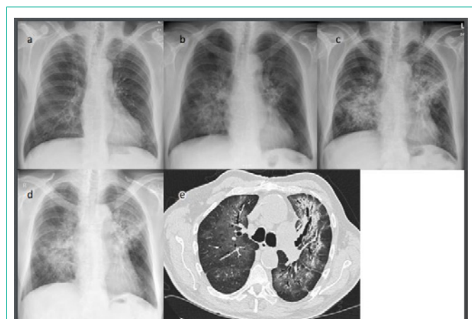
Figure 2: Diagnostic imaging during treatment course illustrating progressive interstitial disease. (a) Pretreatment X-ray; X-ray after introduction of Imatinib for; (b) 9 weeks; (c) 13 weeks; (d and e) 16 weeks. (e) HRCT showing ground-glass opacity, bronchiectasis and fibrosis.

ILD can occur secondary to a broad range of systemic diseases, after many different exposures including as drug toxicity. Most frequently it presents with dyspnea, cough, fever, and hypoxemia due to chronic inflammation and/or skin damage resulting in progressive fibrosis. The diagnosis is supported by the case history, relevant exposure, and radiological findings, but lung biopsy may be necessary for accurate diagnosis. Extensive diagnostic work-up may also be needed with regard to primary disease.