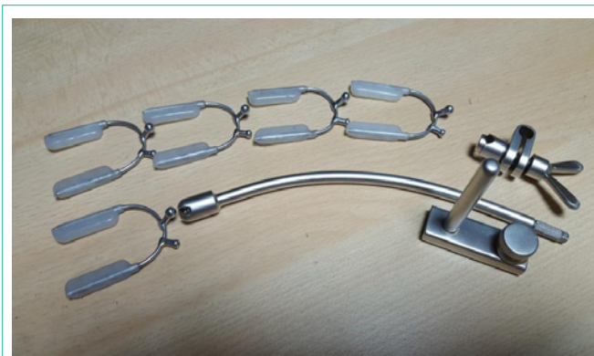
Figure 1: SIMS- Simple Indian Made Stabilizer.

The stabilizer rod is in fact a curved metallic tube which houses another curved metal rod inside. The curved out tube has a distal metal end that holds a housing in which the pod head could play