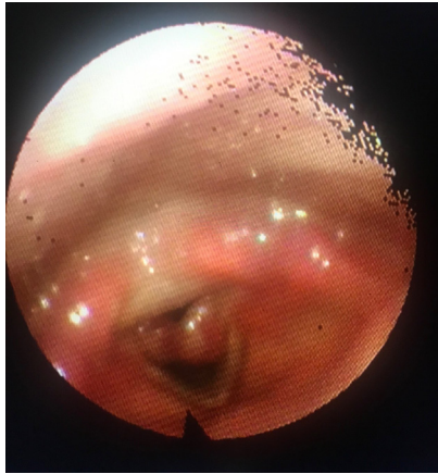
Figure 1: Two rounded granulomas arising on both sides of the vocal cords with obstruction of 2/3 of tracheal light.