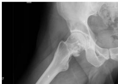
Figure 1A: Anteroposterior x-ray of the pelvis of the right hip: Post-surgical control of hip arthroscopy.