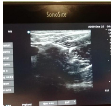
Figure 3: Obturator distal guided block with ultrasound echography.

On physical examination, limitation of passive and active joint mobility was detected, which was painful and increased to external and internal rotation. Also a non-mobile stone tumor in the lower