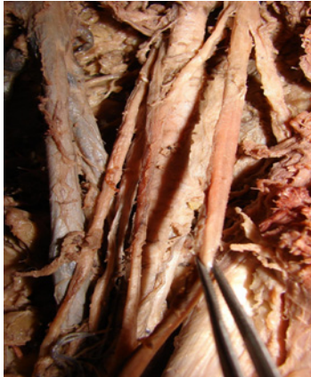
Figure 2: On the left side, the lateral cord gave three branches- a branch to the coracobrachialis, a slender lateral root of median nerve and another branch to join the median nerve about 10 cm from the coracoid process.

and Gümüşburun [8] classified five types of variation, with the 5 th type being the complete absence of musculocutaneous nerve, where anterior arm muscles will be supplied by the median nerve. Our present case had complete absence of the MCN coinciding Le Minor's and Gümüşburun [2,8] 5 th type of classification but different from the above classification by the branch to the coracobrachialis arising from the lateral cord of brachial plexus. The branch to coracobrachialis arising from the lateral cord of brachial plexus has been reported by Tatar [9].