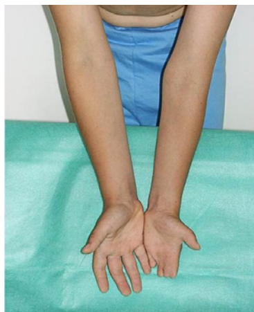
Figure 1: Patient with the classic deformity (brachysyndactyly) (type 3B).

From the group of 19 patients only 8 (5 females and 3 males) were