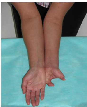
Figure 2: Patient with cleft hand (type 4D).

operated on in Our Center (Figure 3). All procedures were performed under general anaesthesia, at limb ischemia. Syndactyly separation was accompanied by web formation with the use of either 2 triangular flaps or 1 rectangular flap. In 4 patients, syndactyly affected fingers 2-5 and in those cases, separations of fingers 2 and 3 and fingers 4 and 5 were performed at one time. Syndactyly of fingers 3 and 4 was treated at the next stage. Six patients required surgical enlargement of finger web. Syndactyly separation was performed at kindergarten age (between the ages of 2 and 6). Only 1 female patient underwent the procedures at an older age (9 and 10) due to the fact that patient's parents had not reported to the hospital until she was 9. After treatment finishing, patients were able to perform alternating finger movements, impossible previously, and two of them started learning how to play keyboard instruments.