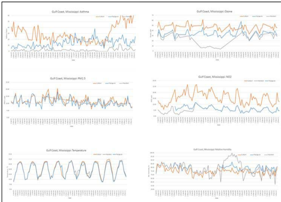
Figure 2: Time series of asthma, PM_{2.5} , Ozone, NO_2 , Temperature, and Humidity of data of Mississippi Gulf Coast regions during the period of 2003 to 2011.