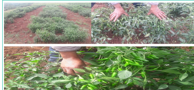
Figure 3: The performance of Chilli pepper exp't at Kiltu sorsa on-farm.