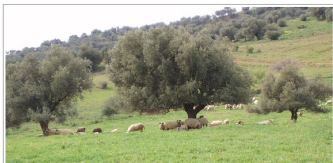
Figure 6: Olive tree.

In the grape itself 30 % of the polyphenols are found in the husk, 10 % in the pulp and 60 % in the seed [17]. From 1 ton of grape seeds 1 kg of polyphenols can be obtained. Additionally, this product can be obtained from the vine as well. In wine production first a mash is made. For manufacturing of red wine the pomace is separated after the fermentation, while the pomace is not fermented for the production of white wine.