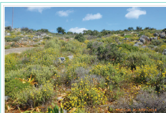
Figure 2: Typical vegetation, Phrygana.