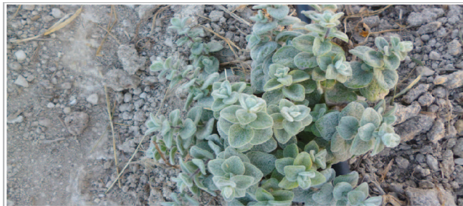
Figure 8: Origanum dictamnus »diktamos«.