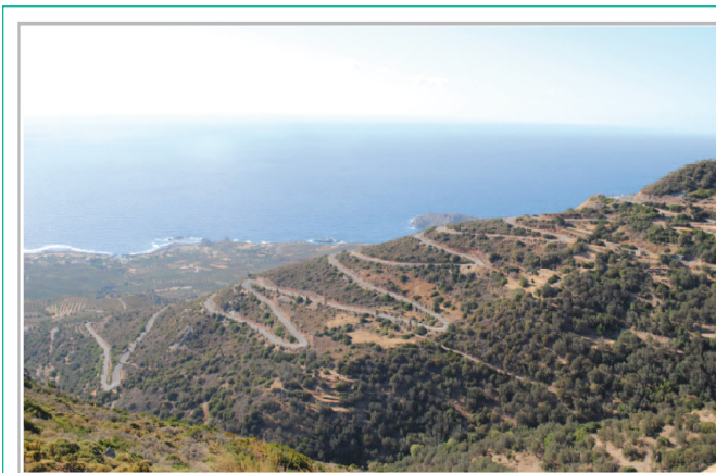
Figure 1: Coast line and olive trees, western crete.

The species that grows on the island and the elevation (when known) that each species preferentially grows at are described in a table which is provided separately [5].