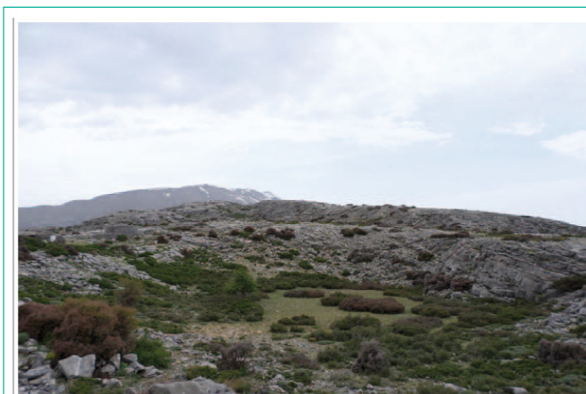
Figure 3: Mounatain of Psiloritis.