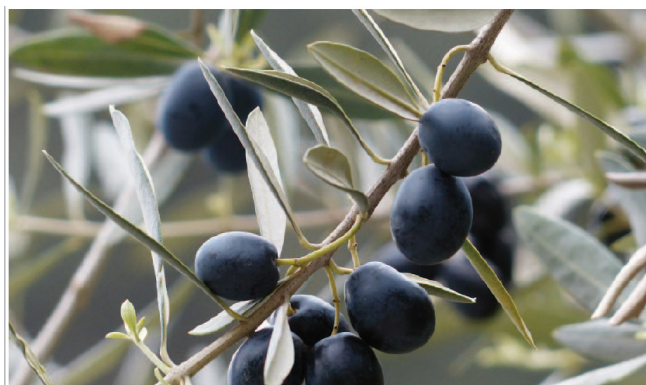
Figure 4: Cretan Olives.

When thinking about typical Cretan products, the first is the valuable Cretan olive oil. The cultivation of olives has an amazing history of more than 5,500 years on the island. On average every resident owns 30 trees. In total about 20 million olive trees are said to grow on about 44 % of the arable land. With this amount of trees every year 150,000 to 180,000 tons of olive oil are produced. The weight of harvested olives is even higher, since 4-7 kg of olives are needed to produce a litre of oil. Every tree carries about 20 kg of fruits [10]. The world-wide olive oil production is about 2.9 million tons. 95 % of the 750 million olive trees grow in the mediterranean area, 40 % thereof in Spain. Greece is the third largest producer [11]. The most olive trees in Crete are of the species »Koroneiki« (80-90 %), but in some districts there are rare species such as the »Tsonati« olive. An olive of the species »Koroneiki« has an oil content of about 22 %. This represents about 0.5 g oil. In addition to the oil the olive consists of water (50 %), sugar (19.1%), cellulose (5.8%) and proteins (1.6 %) [10].