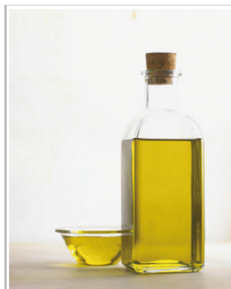
Figure 5: Olive oil - Legendary in Crete.

products are ready for the market. With the knowledge of the olive and the know-how of the processes to extract the olive oil and all the by-products of this process, the olive could become the fundamental pillar of the »Cretan Cosmetics«.