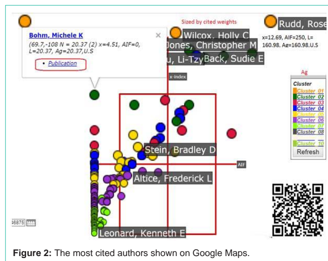
Figure 2: The most cited authors shown on Google Maps.

PMC, we used the keywords “opioid use disorders” on October 7, 2018, and downloaded 371 articles published since 2000. An author-made Microsoft Excel visual basic for application module was used to analyze the data. All the downloaded abstracts were based on the type of journal article. All the data used in this study were downloaded from PMC, which means that the study required no ethical approval according to the regulation promulgated by the Taiwan Ministry of Health and Welfare.